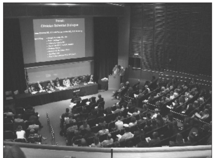
Figure 4 The Clinician-Educator/Scientist Panel.